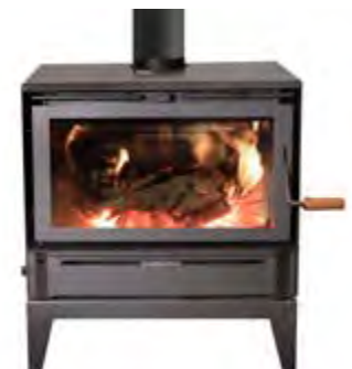
Boxer 24 with optional Leg Base