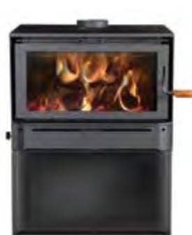
Boxer 24 with optional Pedestal Base

Burn 33% Less Wood Our unique combustion system makes the Boxer one of the most efficient stoves in the world, thus lowering your heating costs and load time by up to 33%